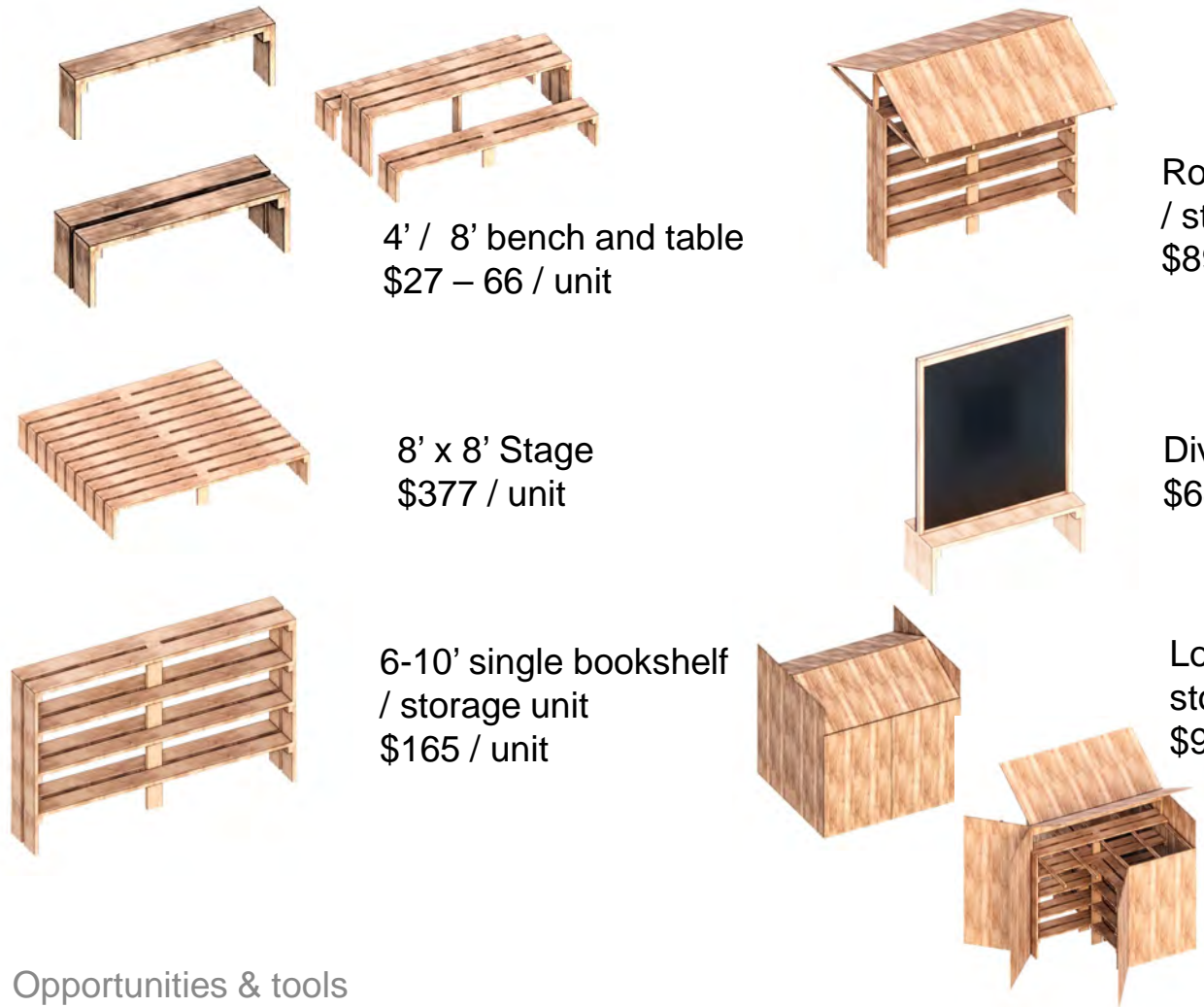
4' / 8' bench and table $27 – 66 / unit